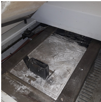
Wave solder pot with dross.

5744 must be used on a still solder pot surface. All solder wave pumping and agitation action must be turned off. The pot temperature should be controlled to 232-260°C (450-500°F). Cover the solder surface with 5744 by sprinkling the powder on the pot in a thin covering layer, no greater than 6.4mm (0.25in) thick. Slowly mix the salt with the surface of the solder with a metallic solder ladle or a metal spatula. Allow the salt 10 seconds after mixing to convert the dross back to solder. Move any dross on the pot into the salt covered surface to convert the dross to metal. When done, remove the dross recovery salt and other dirt residues with a metallic solder ladle or a metal spatula. All of the 5744 should be removed from the solder surface. 5744 is intended to be used as received.