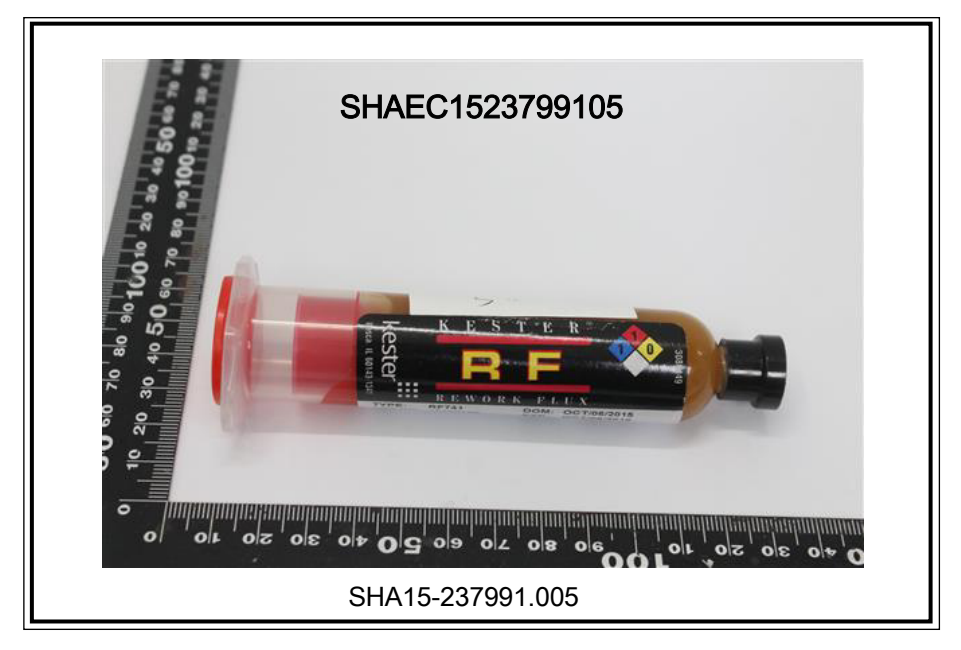
SGS authenticate the photo on original report only