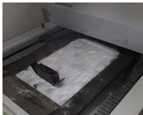
A thick layer of 5744 placed on top of solder surface.