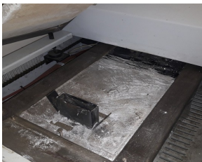
Wave solder pot with dross

5744 must be used on a still solder pot surface. All solder wave pumping and agitation action must be turned off. The pot temperature should be controlled to 232 to 260 °C (450 to 500 °F). Cover the solder surface with 5744 by sprinkling the powder on the pot in a thin covering layer, no greater than 6.4 mm (0.25 in) thick. Slowly mix the salt with the surface of the solder with a metallic solder ladle or a metal spatula. Allow the salt 10 seconds after mixing to convert the dross back to solder. Move any dross on the pot into the salt covered surface to convert the dross to metal. When done, remove the dross recovery salt and other dirt residues with a metallic solder ladle or a metal spatula. All of the 5744 should be removed from the solder surface. 5744 is intended to be used as received.